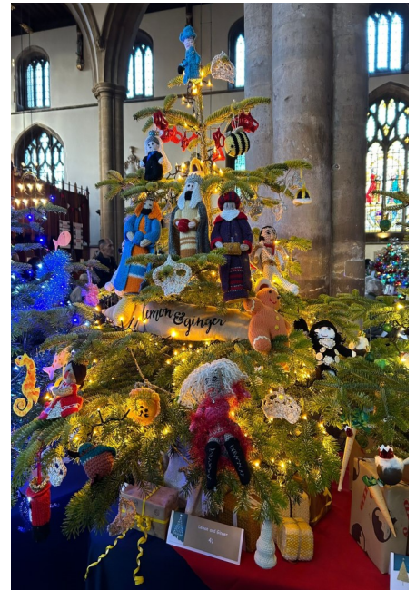
Lemon & Ginger winner above 1st Brickhill Brownies below